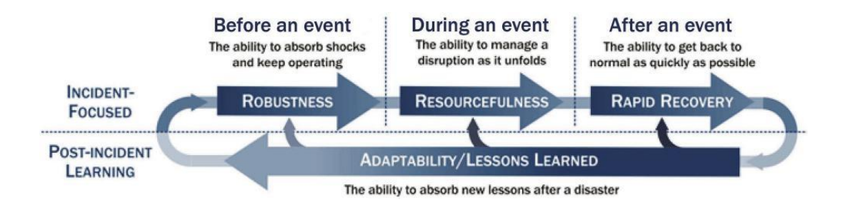
Figure 2. The Resilience Construct (from Berkeley and Wallace, 2010)